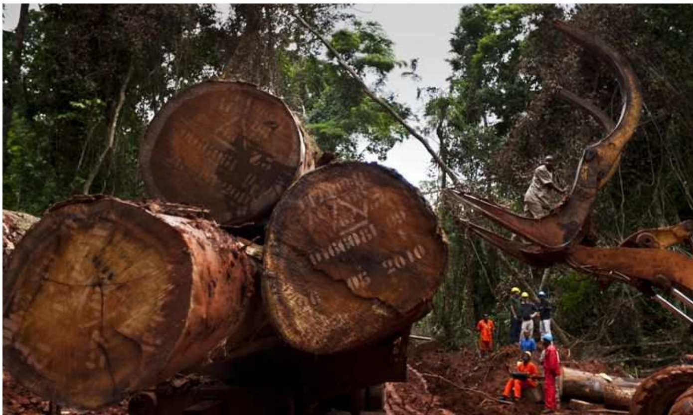
Workers cut down trees in southeast Cameroon as part of a sustainable initiative to help local groups with forest management.

In South Africa and Australia, businesses wanting to encroach on ecosystems that are classed as critically endangered or endangered must first conduct a full environmental impact assessment for their proposed project. Likewise, Finland's first government-led systematic ecosystem assessment, completed in 2008, resulted in increased protection of threatened forest under the nation's Environment Protection Act and Forest Act 17 .