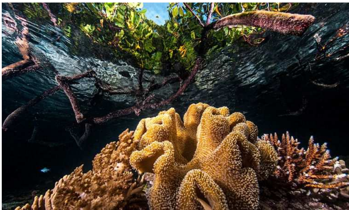
Coral in a mangrove swamp in the Raja Ampat Islands, Indonesia.