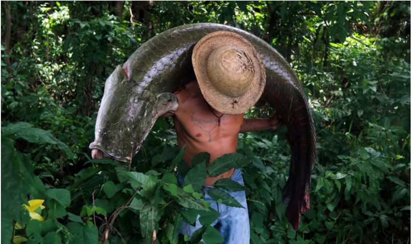
Human impacts such as overfishing have affected the Amazon River ecosystem in Brazil.

Ecosystems, from the boreal forest and wetlands to coral reefs and mangroves, are more than the total of the plants and animals living in them 5 . Complex interactions between biological and physical systems drive processes that sustain all life. This includes production of clean water, regulation of air quality and climate through carbon sequestration and storage, soil formation, pollination and the production of food and wood for houses 1 . Indeed, natural systems are key to dealing with the effects of climate change, as highlighted by a 2019 study 6 . It estimated that, between 2000 and 2013, the impact on carbon levels of losing intact tropical forests (including indirect effects such as reduced biodiversity and increased selective logging) might be six times greater than was originally proposed 6 .